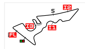
Circuit Of The Americas 5513 m.