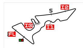
Circuit Of The Americas 5513 m.