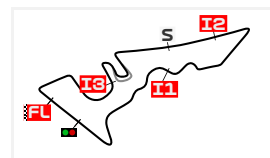
Circuit Of The Americas 5513 m.