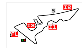
Circuit Of The Americas 5513 m.