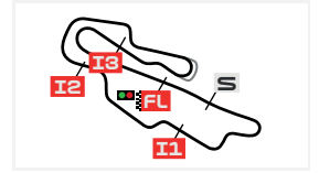
Autodromo Internazionale del Mugello 5245 m.