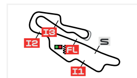
Autodromo Internazionale del Mugello, 4.23 m.