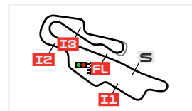
Autodromo Internazionale del Mugello 5245 m.